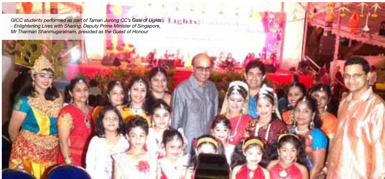
GICC students performed as part of Taman Jurong CC's Gala of Lights - Enlightening Lives with Sharing. Deputy Prime Minister of Singapore, Mr Tharman Shanmugaratnam, presided as the Guest of Honour