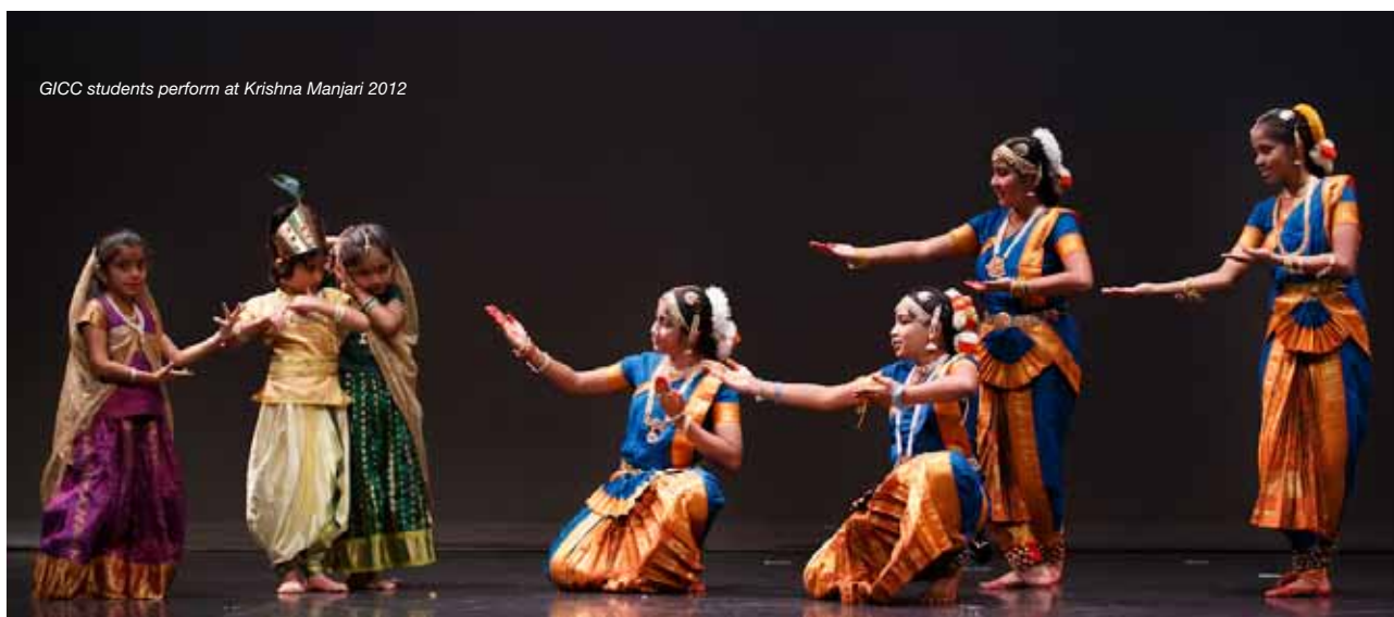
GICC students perform at Krishna Manjari 2012